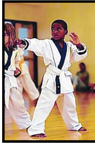
Martial Arts provides fun for the whole family.