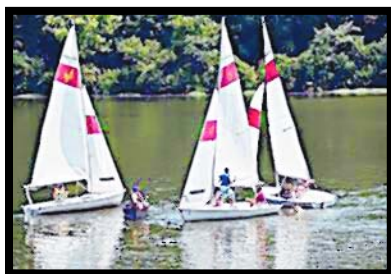
Kids participate in CA's Nature/Sail Camp.

W ith summer right around the corner and the end of the school year in sight, kids are