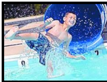
Check out CA's Summer Pool Schedule on page 3.

For a more structured day, CA provides an impressive array of summer camps for students in Pre-K